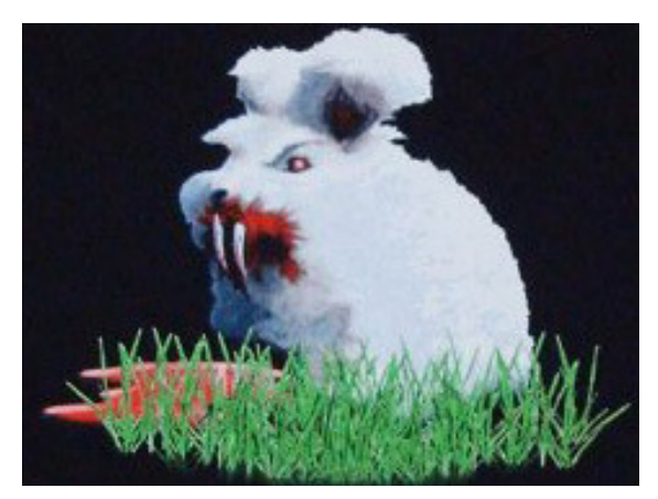
Scene 4: The Ten Plagues

Killer rabbits The Spanish Inquisition 1000-ton weights Crunchy frogs Giant badgers Dead parrots Silly walks Plague six. There IS no plague six! Spam. The killing of the first born